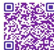
Multi-Disciplinary Courses (MDC)