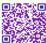
Value Added Courses (VAC)