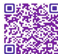
Multi-Disciplinary Courses (MDC)