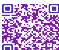
Skill Enhancement Courses (SEC)