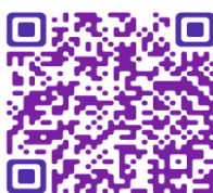
Ability Enhancement Courses (AEC)